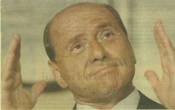
Silvio Berlusconi